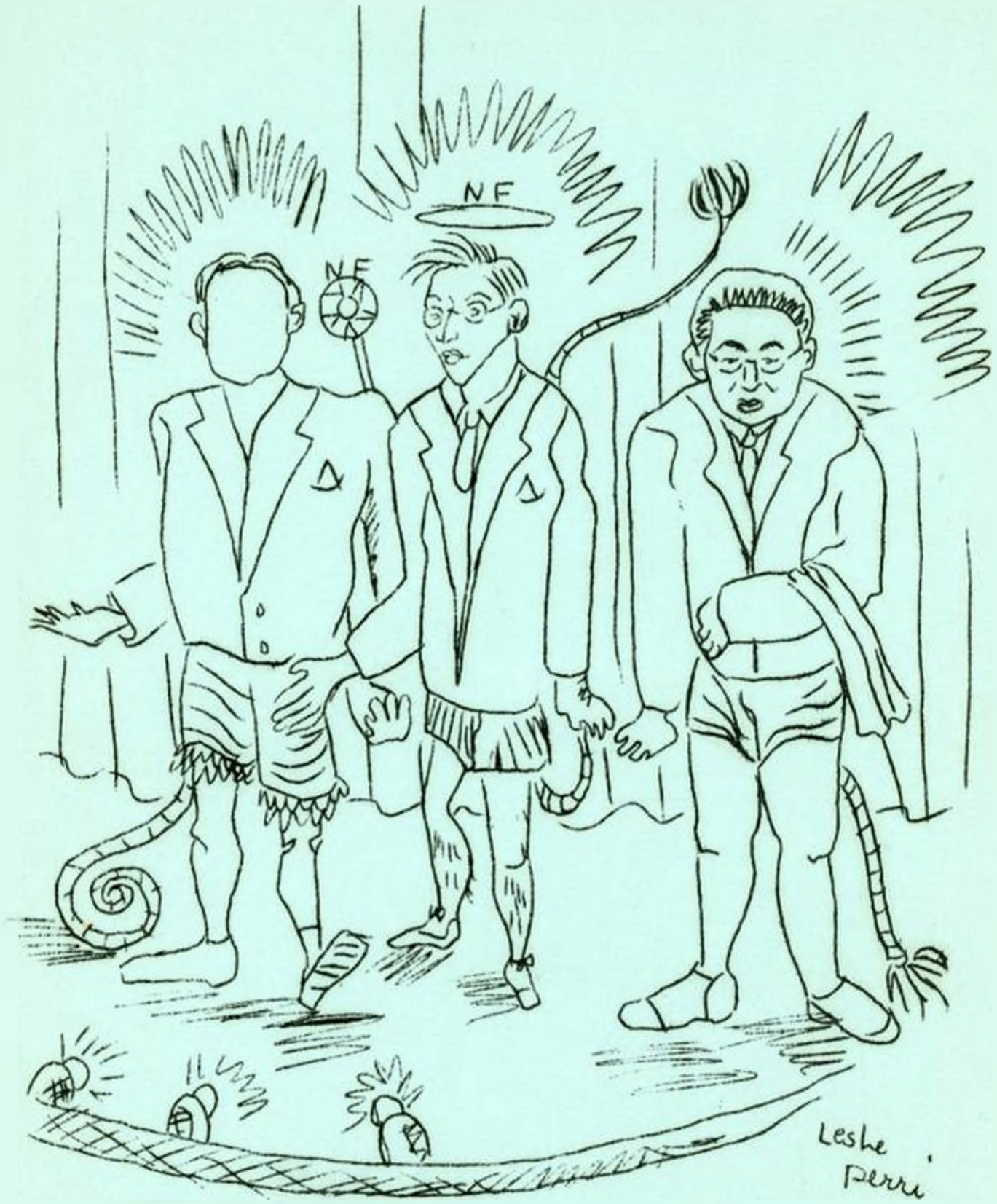
TYRANNOUS UNHOLY TRIO WE